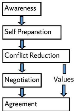
Figure 3. Conflict Resolution Model